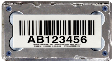
Aluminum label with frame after six months of extensive lift truck and pallet traffic.